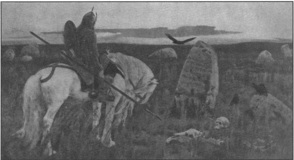
FIG. 11 Viktor Vasnetsov, A Knight at the Crossroads . 1882. Oil on canvas. (Photograph scanned from Viktor Vasnetsov, V. Vasnetsov [Moscow, 1959]).

Trubetskoy's intent, however, extends beyond either a true rendering of Alexander III, who was a giant of a man, or a caricature of the oppressive Russian regime. He simultaneously draws on folklore images of Russian legendary heroes ( bogatyrs ), such as Vasnetsov's Three Bogatyrs (1898; Fig. 12) or A Knight at the Crossroads , and on the tradition of the imperial equestrian monument. By combining the Russian folk motif with the Western equestrian paradigm, he subverts both the Slavophile expectations of Russianness as a source of power and goodness and the Westernizers' trust in the European Enlightenment as a model for Russian historical destiny. Considered in the context of his "interscultural" dialogue with Falconet's Peter I, his monument to Alexander inevitably raises the issue of Peter the Great's legacy in Russia's historical development. If Falconet's