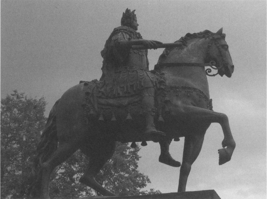
FIG. 3 Carlo Rastrelli, The Monument to Peter the Great (1747). Erected in front of the Mikhailovsky Castle in 1880.