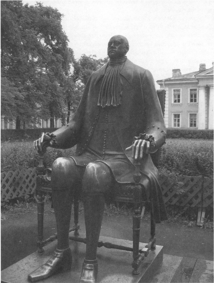
FIG. 13 Mikhail Shemiakin, Monument to Peter the Great . Unveiled in 1991 in St. Petersburg, Russia.

The statue's overall design reflects a significant change in the nation's perception of imperial power from heroic and romantic to oppressive, despotic, and, ultimately, insignificant and prosaic. The pedestal is almost completely eliminated so that the sculpture is not placed significantly above the level of the observer, as is customary in monuments to tsars. The tsar is garbed neither in a classical toga, nor in military dress, nor any kind of heroic attire, but in a generic eighteenth-century European outfit. By eliminating all