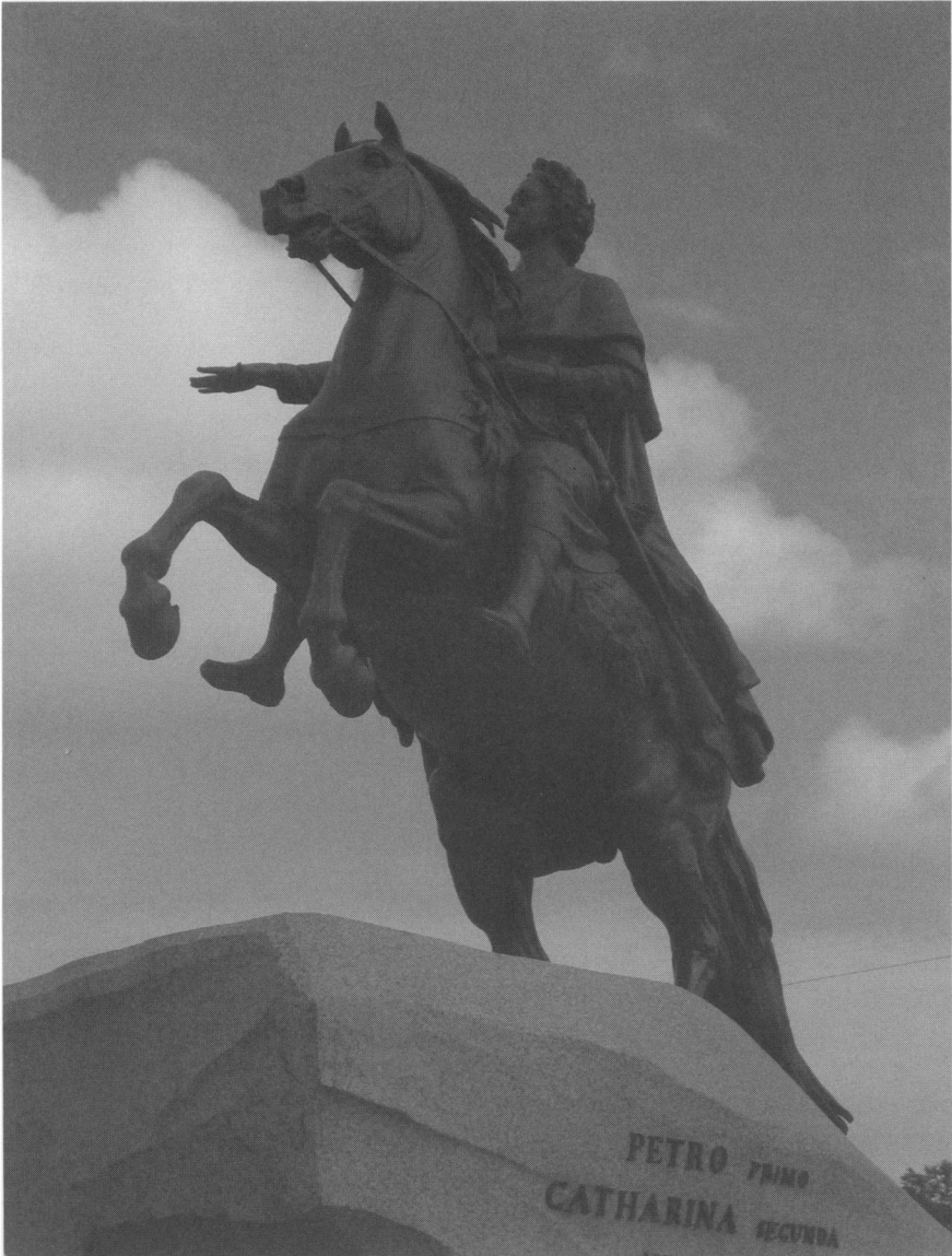
FIG. 2 Etienne Falconet, The Monument to Peter I (The Bronze Horseman) . Unveiled in 1782.

with a new vision of imperial authority. 6 The imperial imagery is further emphasized by Falconet's choice of an equestrian statue, a choice that implicitly links the monument to its famous Roman predecessor—the equestrian statue of Marcus Aurelius in Rome. The wreath of laurel crowning his head and the overall heroic stature of the imperial horseman make the link with the legacy of ancient Rome unmistakable. The Roman