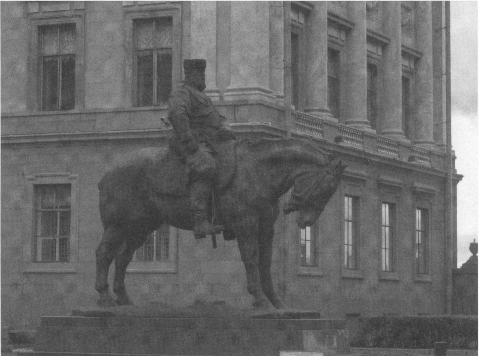
FIG. 7 Paolo Trubetskoy, The Monument to Alexander III . Unveiled in 1909.

Trubetskoy's monument to Alexander III was originally set on Znamenskaia Square (present-day Ploshchad' Vosstaniia) near the Moscow train station. 21 It features a heavy rider clad in traditional Russian dress with knee-high boots and a hat on an equally heavy horse (Figs. 7 and 8). The pedestal is a plain stone base—a clear antithesis not only to the Bronze Horseman's rock shaped as a wave but even to the more traditional pedestals of the Nicholas sculpture and Rastrelli's Peter I with their allegorical figures and scenes of the emperors' achievements. In fact, it is highly revealing that in his initial sketches Trubetskoy played with the idea of a pedestal similar to that of Falconet's statue—a huge rough-edged rock. His replacement of the dynamic pedestal of the Bronze Horseman with a plain square platform reflects his polemical concept and his desire to present Alexander III as the very antithesis to Peter I. The antithetical nature of the monument is obvious: Falconet's elegant, spirited “proud mount,” with a luxurious tail and a magnificent mane, leaping from the edge of the rock is replaced with an overweight, broad-legged steed with a clipped tail (compare Figs. 9 and 10), refusing to carry its master further, digging its hoofs into the ground and stubbornly lowering its head. 22 The image of the