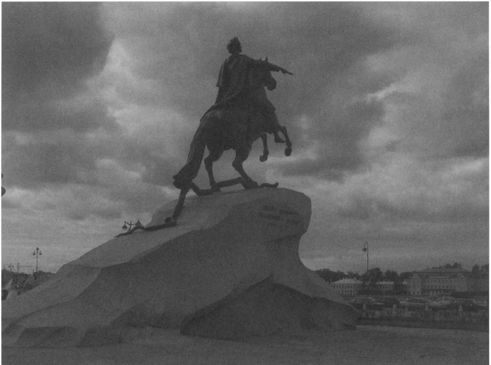
FIG.1 Etienne Falconet, The Monument to Peter I (known as The Bronze Horseman). Unveiled in 1782.

the Great was erected (Figs. 1 and 2). The horse is trampling a serpent beneath its hooves—a reference to Peter’s victory over the forces of Chaos and the underworld. 5 The tsar is represented as galloping on the horse with an enigmatic gaze on his puffy face and his right hand in a gesture about which there has been much speculation. To what degree is Peter really in control of his mount? Is he about to fall back, to recover himself, or to soar up into space? Is he urging the steed on or restraining it in the face of some catastrophic hazard? Is his right hand trying to calm the river that threatens to engulf the city? Some of these questions were voiced by the famous French political thinker Joseph de Maistre in St. Petersburg Nights , where a character inquires of the Peter statue: “Does your hand protect or threaten?”