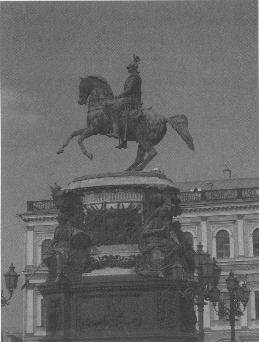
FIG. 6 Monument to Nicholas I, situated on St. Isaac's Square. Unveiled in 1859. Designed by August Montferrand, the horse and the tsar carved by Peter Klodt.

With Paolo Trubetskoy's monument to Alexander III the degeneration of the equestrian image of imperial power reaches its apogee. By 1909, the date of the unveiling of this controversial monument, the spirit of the city had shifted from something represented by a dynamic tsar on top of a crashing wave (on the crest of history) to a static tsar crushing his horse beneath his own weight. Alexander III emerges as an ominous caricature of the Bronze Horseman. The riders seem to embody the two polar attitudes toward Peter the Great's legacy, toward Russia, its imperial city, and the direction that it was taking.