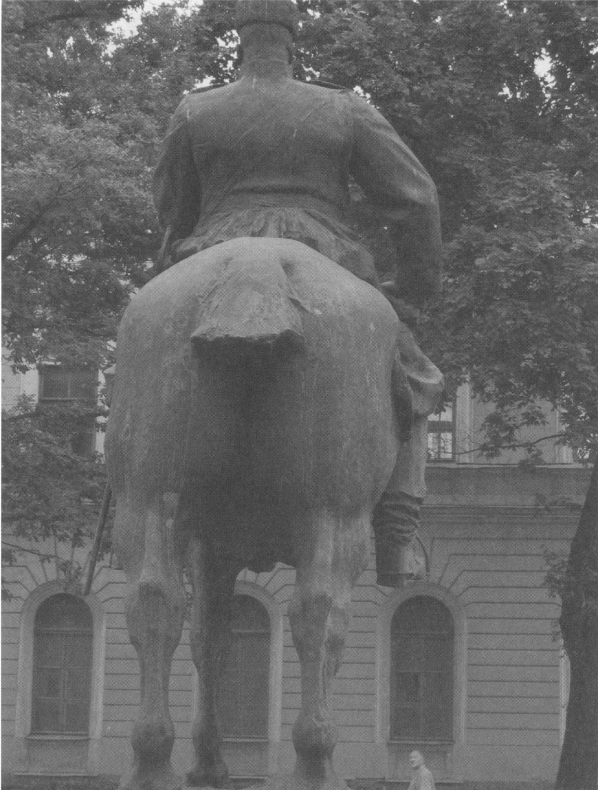
FIG. 10 Paolo Trubetsky, The Monument to Alexander III . Unveiled in 1909.

notwithstanding their attitude toward Peter the Great's reforms—welcomed the monument as a powerful indictment of the tsarist tyranny. The folklore of the day underscores the unpopular view of the tsar: Na komode begemot, na begemote idiot, na idiote shapka (“The chest-drawer supports an hippopotamus, the hippopotamus holds an idiot, and the idiot wears a hat”). For many, the mighty image of Alexander became an emblem of all Russian rulers and the tyranny of monarchy in general. Thus, for example, Kornei Chukovsky in his memoirs about Ilia Repin insists that, as a committed democrat and an enemy of tsarism, Trubetsky represented this “guardian of monarchy” as a gloomy and