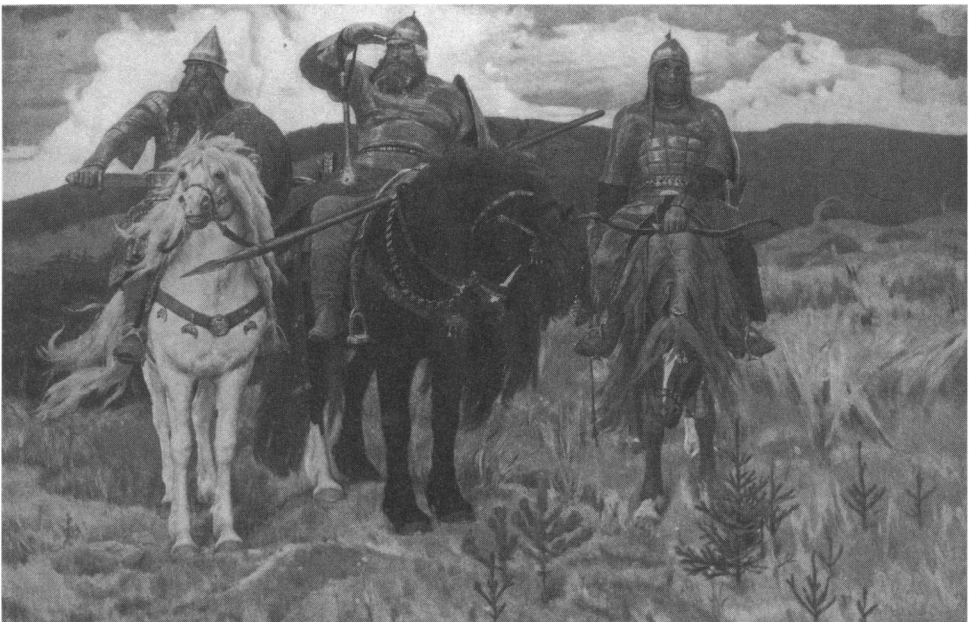
FIG. 12 Viktor Vasnetsov, Three Bogatyrs . 1898. Oil on canvas. The Tretyakov Gallery, Moscow, Russia.

Trubetskoy's monument to Alexander III signifies, therefore, a complete break with, and perversion of, the central figure in the St. Petersburg myth—Falconet's statue to