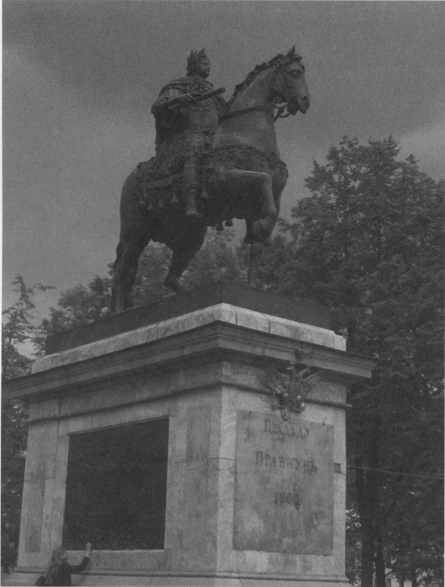
FIG. 4 Carlo Rastrelli, The Monument to Peter the Great (1747). Erected in front of the Mikhailovsky Castle in 1880.

By contrast, one of Falconet's immediate predecessors and competitors, the renowned Italian sculptor Carlo Rastrelli, crafted a sculpture of Peter the Great, the casting of which was completed between 1745 and 1747, precisely in the tradition of Marcus Aurelius (Figs. 3 and 4). 10 This impressive baroque monument shows the powerful figure of the tsar in imperial attire sitting on a heavy but beautiful horse with a luxurious tail and an elegantly raised right foreleg, set above a marble edifice decorated with two bronze