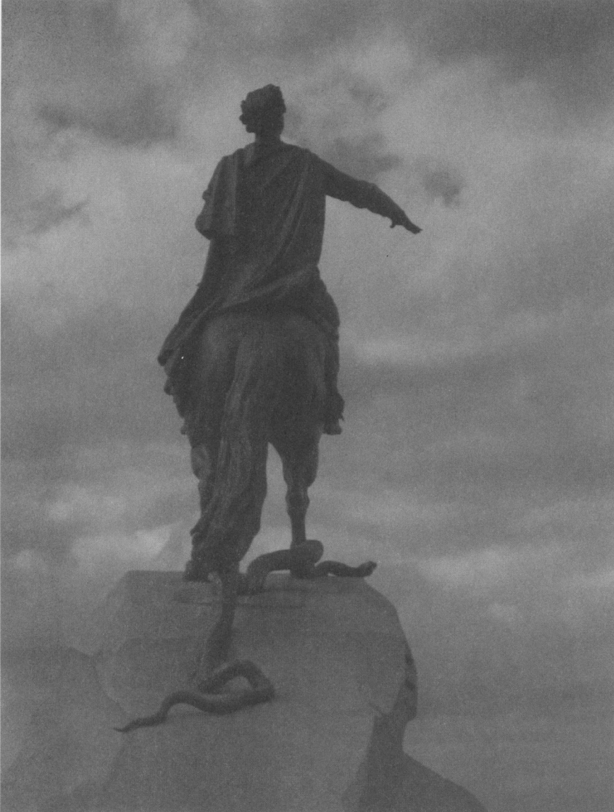
FIG. 9 Etienne Falconet, Monument to Peter I (The Bronze Horseman).

It is hardly surprising that Trubetskoy's masterpiece immediately caused a public scandal. While the more reactionary sector of society was indignant, the democrats—