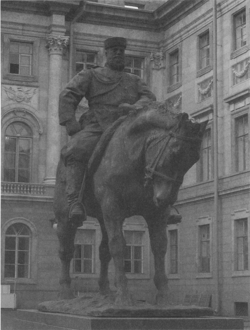
FIG. 8 Paolo Trubetsky, The Monument to Alexander III . Unveiled in 1909.

horse refusing to go forward and lowering its head must also have been perceived as a reference to the then well-known Viktor Vasnetsov's painting A Knight at the Crossroads (1882; Fig. 11), suggestively portraying a knight on a horse in a very similar pose, stopping at the sight of the field of death covered with tombstones and human skulls, with crows hovering above it. The sculptor was clearly inviting the later Romanovs to contemplate how far they were removed from the true Petrine spirit. The very stout bronze figure of